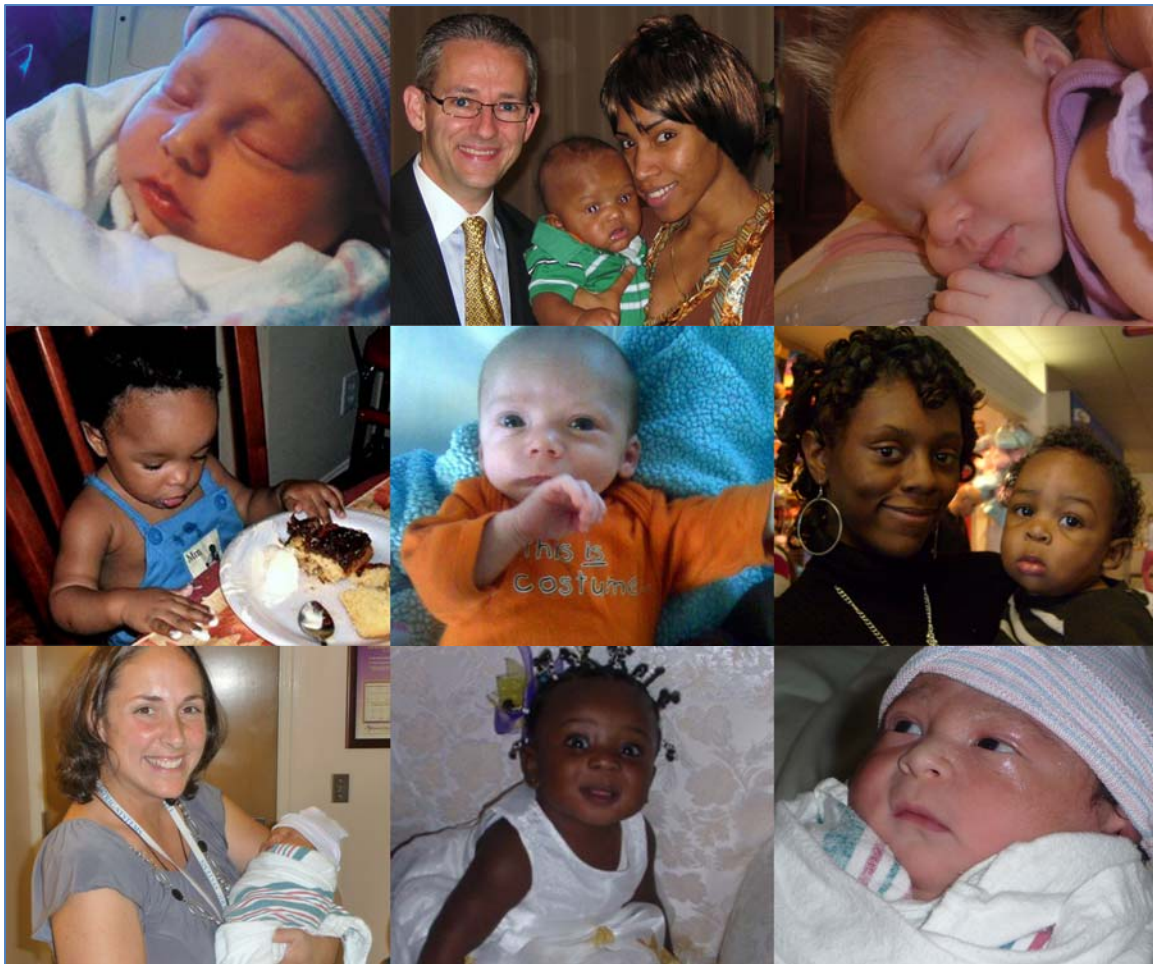
Just a few of the 5,000+ babies spared from abortion by 40 Days for Life

Pray. Ask God to keep the 40 Days for Life momentum building until that glorious day when abortion ends– when no more babies die and no more women cry.